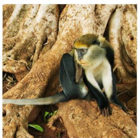
Boabeng-Fiema Monkey Sanctuary

Ghana is a nature lover's delight. There is an enchanting selection of wildlife, ranging from elephants to monkeys and from marine turtles to crocodiles, as well as hundreds of colourful birds and butterfly species. Some of the ecotourism sites include: Kakum National Park, Bunso Arboretum, Adanwomase Kente Village, Shai Hills Wildlife Area, Paga Sacred Crocodile Pond, Mole National Park, Wechiau Community Hippo Sanctuary and River Safari, Tafi Atome Monkey Sanctuary, Wli Waterfalls, Nzulezu Stilt village, Tano Boase Sacred Grove and Formations and Boabeng-Fiema Monkey Sanctuary.