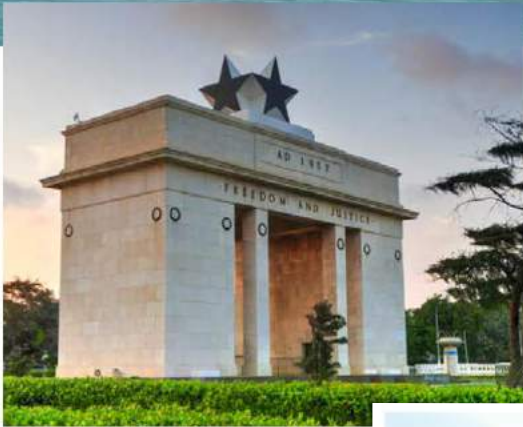
Black Star Square