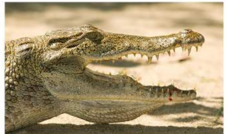
Paga Crocodile Pond