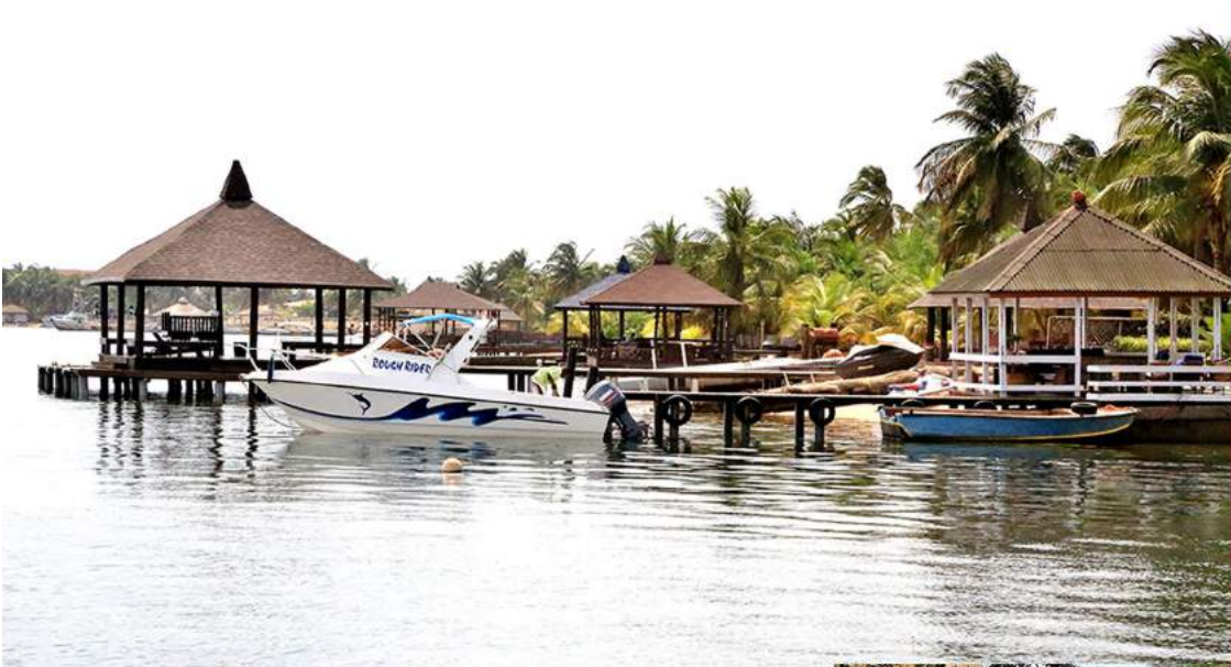
Crusing at Ada