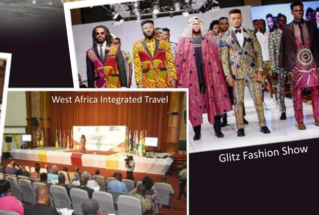
West Africa Integrated Travel