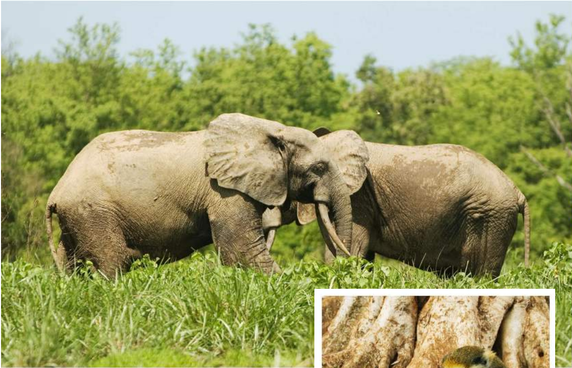
Mole National Park

Ghana is a nature lover's delight. There is an enchanting selection of wildlife, ranging from elephants to monkeys and from marine turtles to crocodiles, as well as hundreds of colourful birds and butterfly species. Some of the ecotourism sites include: Kakum National Park, Bunso Arboretum, Adanwomase Kente Village, Shai Hills Wildlife Area, Paga Sacred Crocodile Pond, Mole National Park, Wechiau Community Hippo Sanctuary and River Safari, Tafi Atome Monkey Sanctuary, Wli Waterfalls, Nzulezu Stilt village, Tano Boase Sacred Grove and Formations and Boabeng-Fiema Monkey Sanctuary.