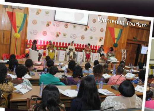
Women in Tourism